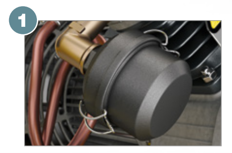
Silenced air intake filter